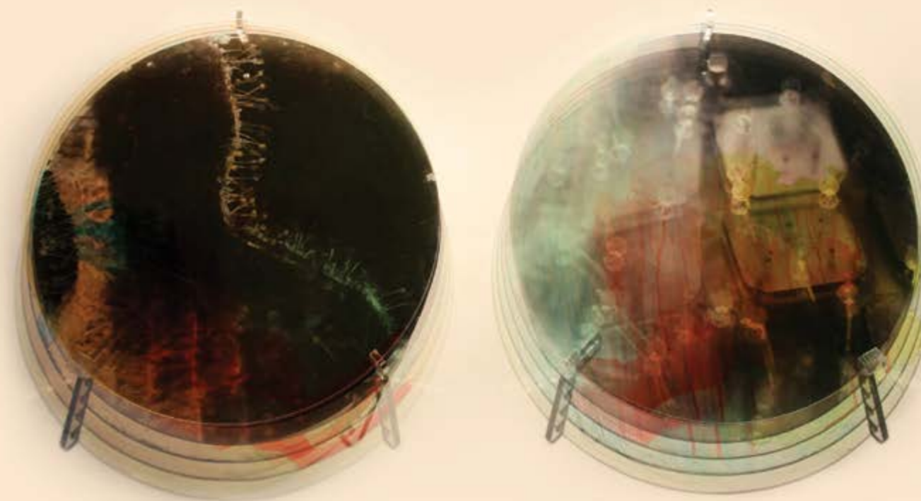
Fika Ria S, Tumpuk Lapis, Tampak Isi Mystic #3 Digital print, oil paint on plexiglass, D: 60 cm x 2, 2017