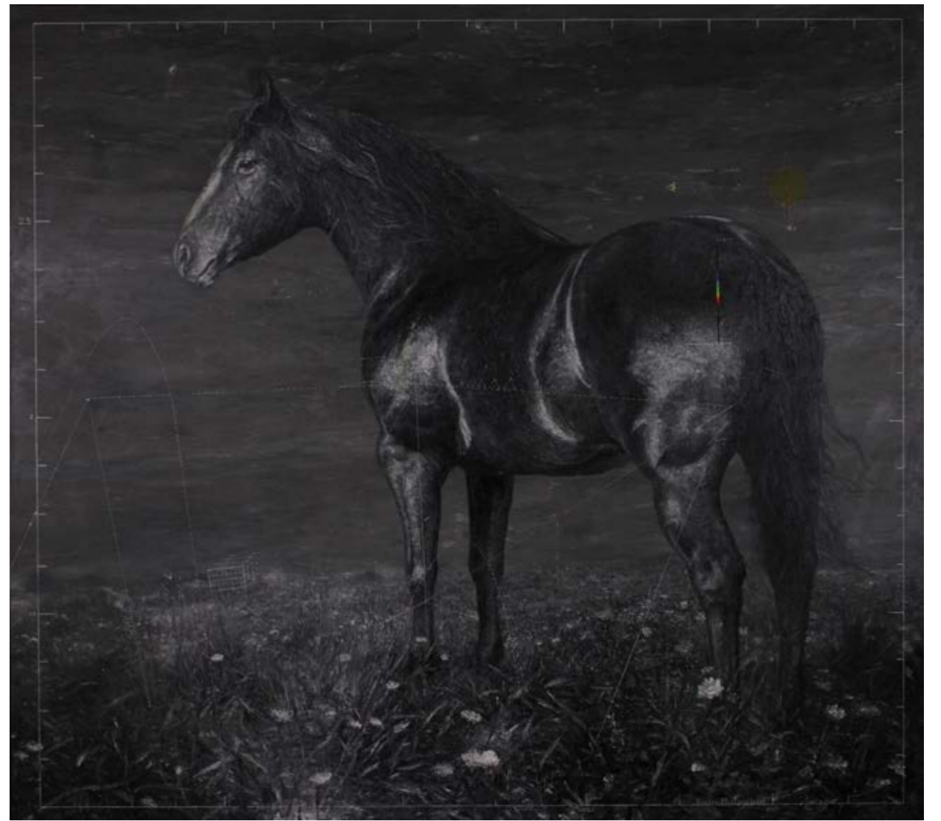
Afdhal, Tumbuh #3 , Acrylic on canvas, 200 x 180 cm, 2017