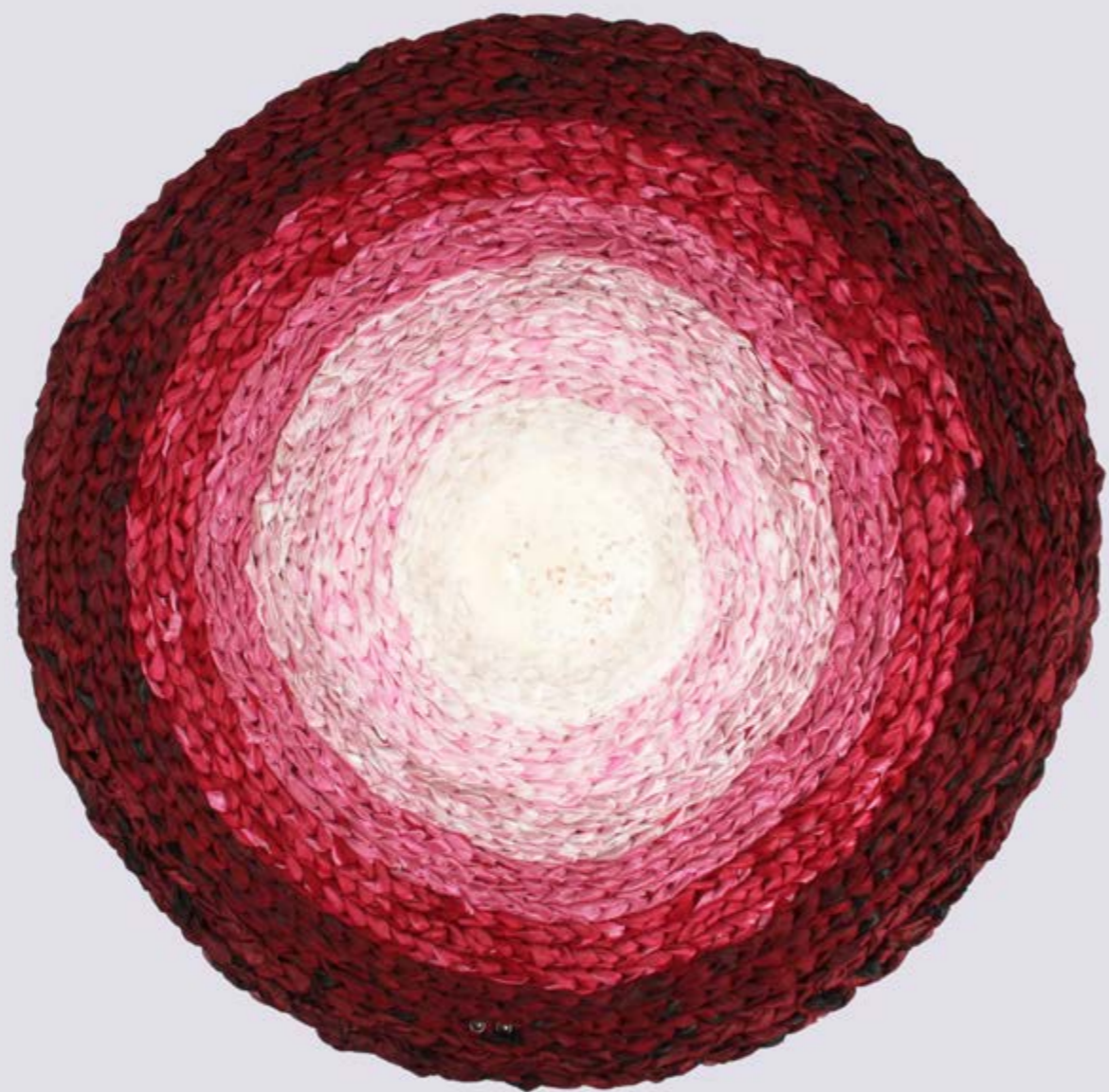
Fika Ria S, Tumpuk Lapis, Tampak Isi, Multiple Layers Resin, beads, fabric, thread, nylon, oil paint, LED, plexiglass, sensor, D: 100 cm, 2017