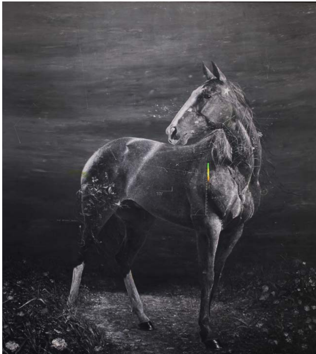
Afdhal, Tumbuh #2 , Acrylic on canvas, 200 x 180 cm, 2017