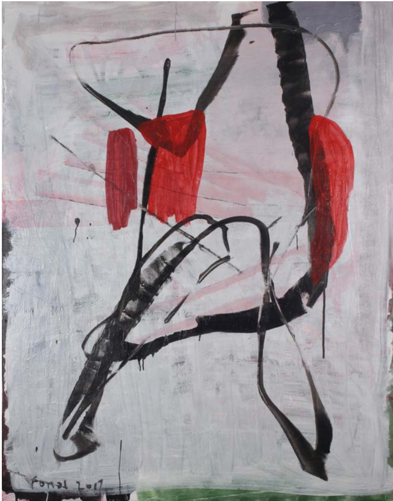
Ronal Efendi, Backwash , Acrylic on canvas, 180 x 140 cm, 2017