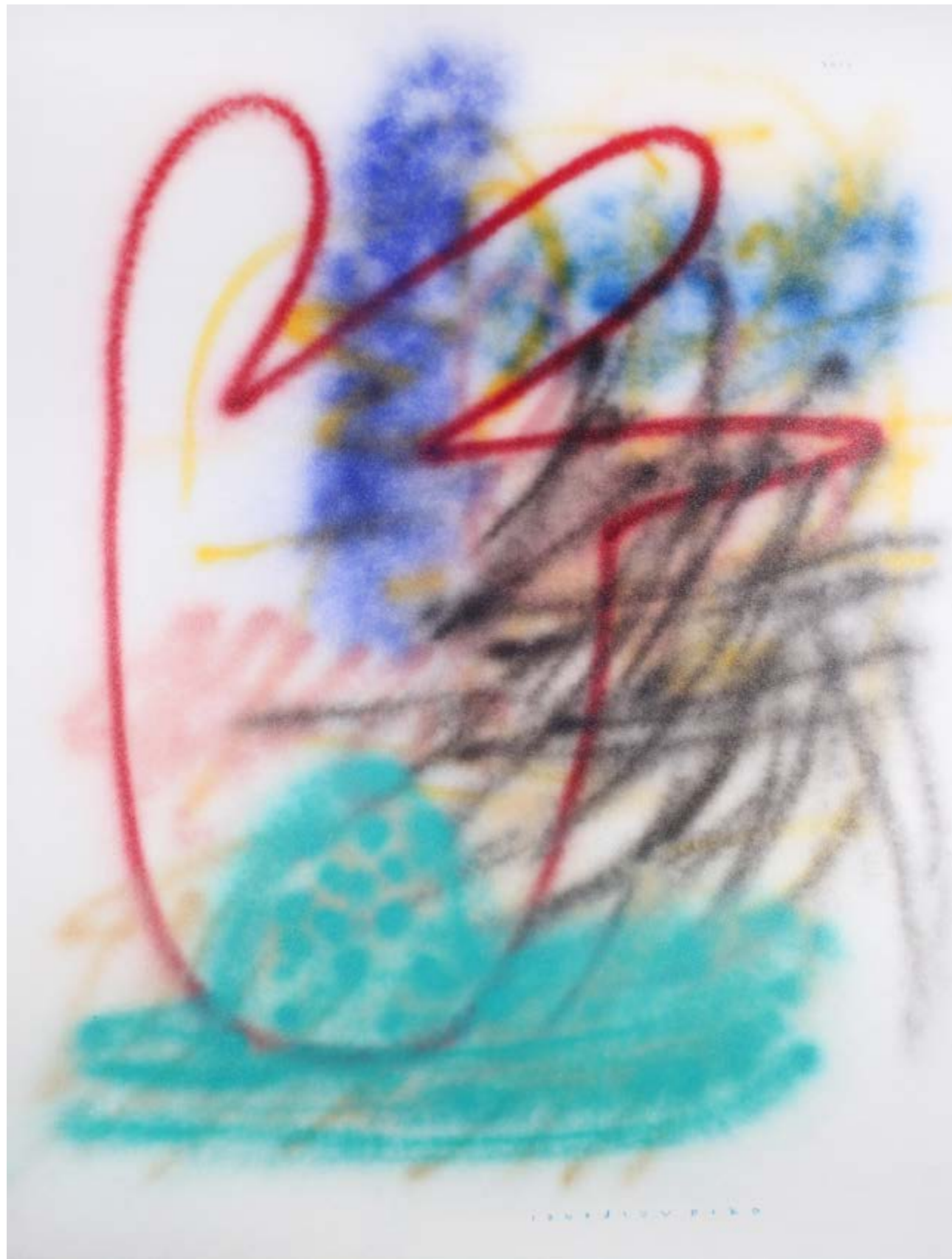
labadiou Piko, Anatomi Kabur , Spray Paint, Acrylic on linen blend, 200 x 150 cm, 2017