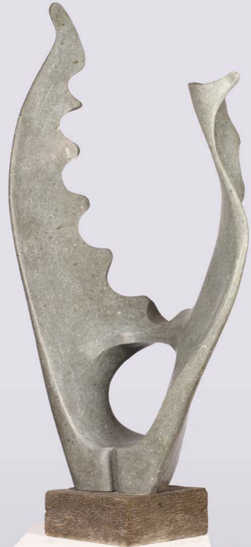
Akmal Jaya Tumbuh#3 77 x 39 x 15 cm Granite 2017