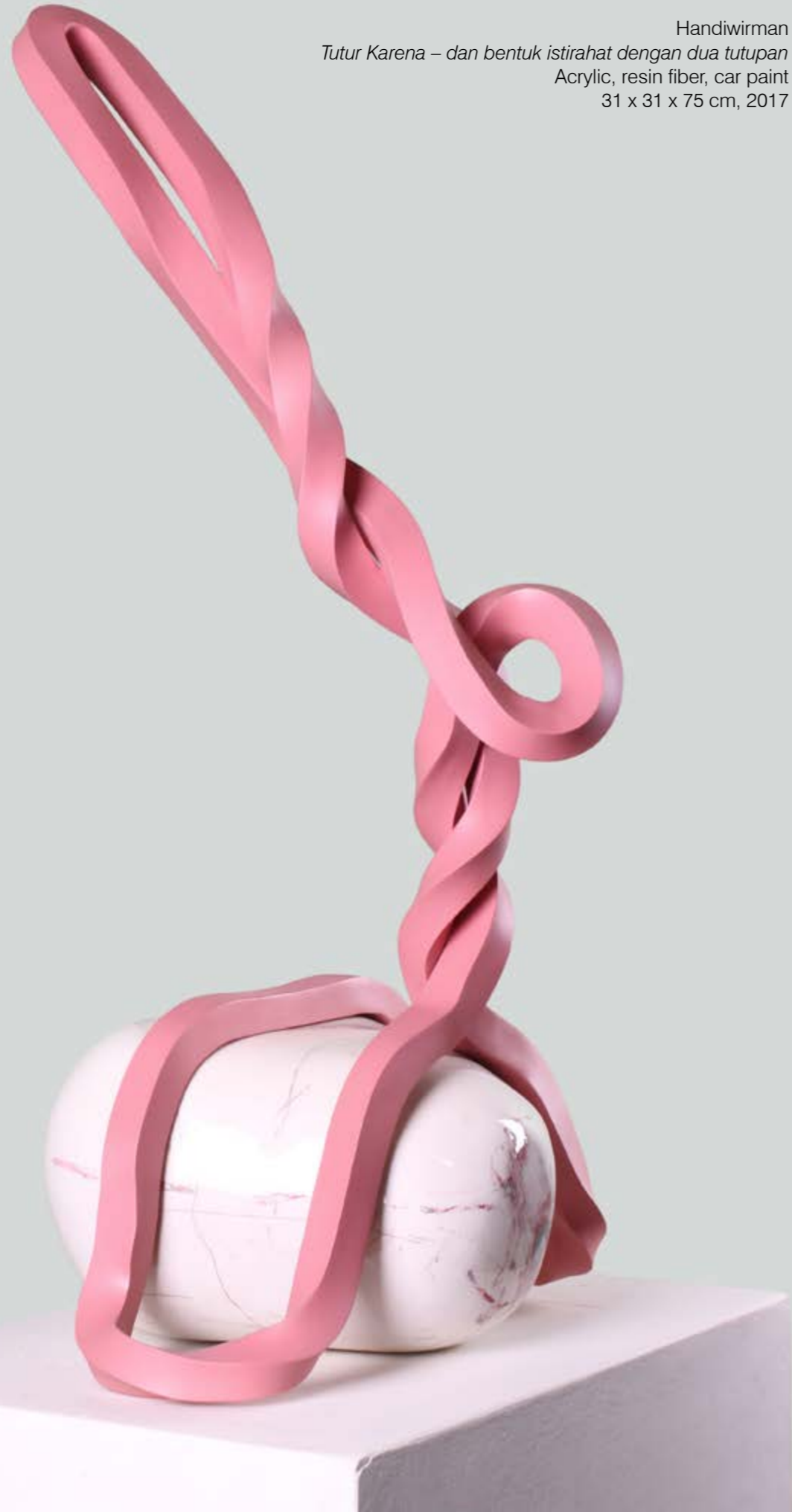
Handiwirman Tutur Karena – dan bentuk istirahat dengan dua tutupan Acrylic, resin fiber, car paint 31 x 31 x 75 cm, 2017