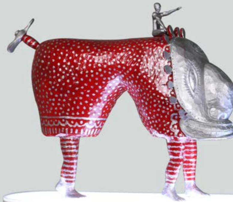
Alexis, The Journey , Oil paint on teakwood, 60 x 25 x 49 cm, 2017