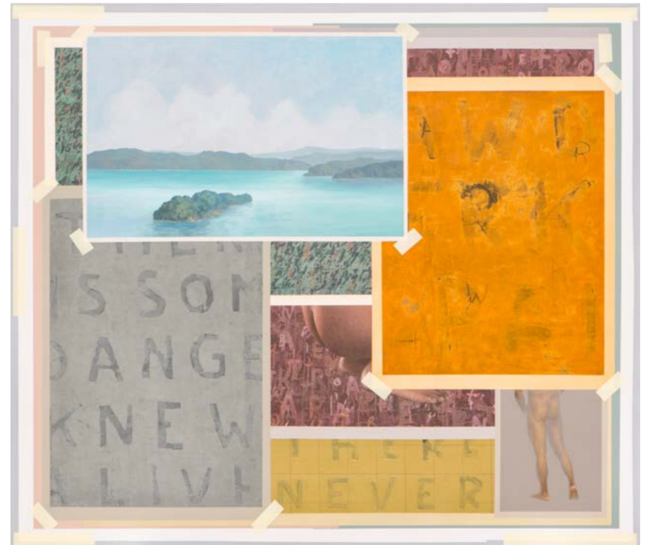
Jumaldi Alfi, Melting Memories, Collage Painting #03 , Acrylic on linen, 190 x 220 cm, 2015