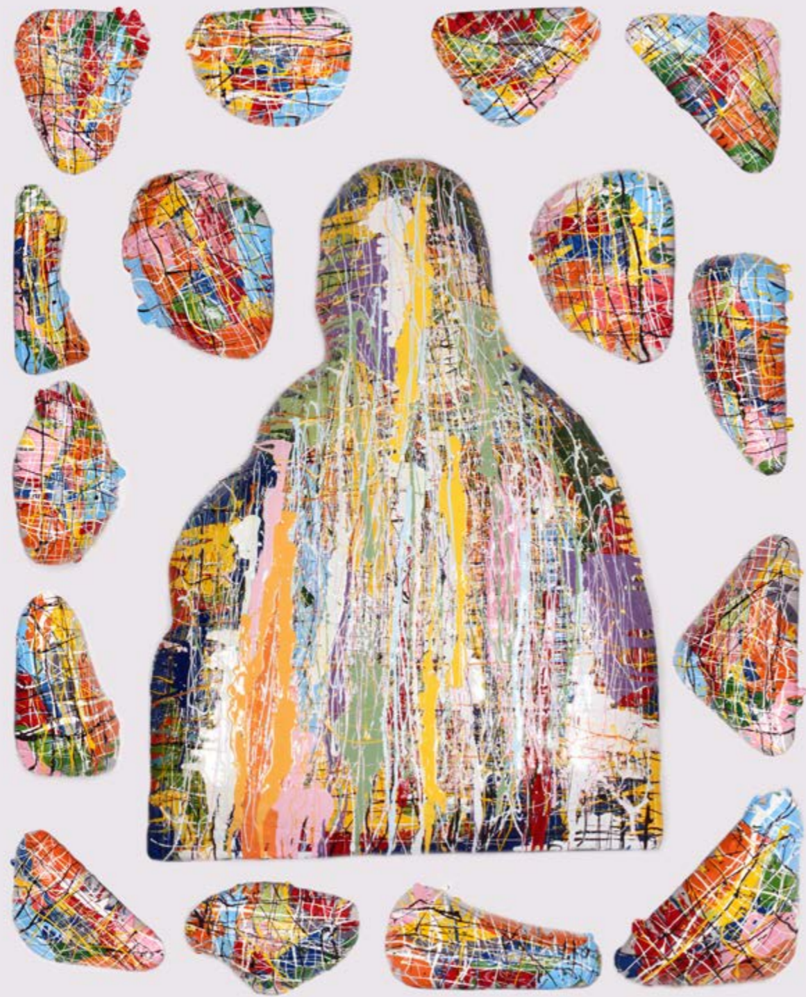
Abdi Setiawan, Monalisa , Fiberglass colour pigmen and fosfor, 240 x 165 cm, 2017