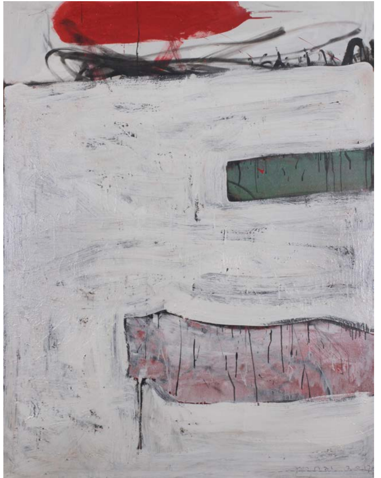
Ronal Efendi, Two Drifter , 180 x 140 cm, Acrylic on canvas, 2017