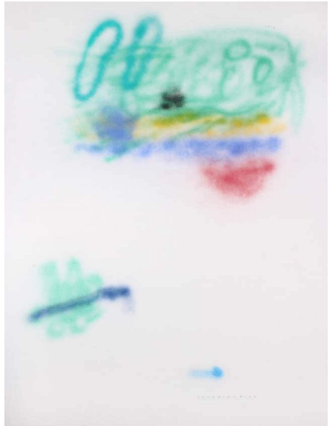
labadiou Piko, 2017, Spray Paint, Acrylic on linen blend, 200 x 150 cm, 2017