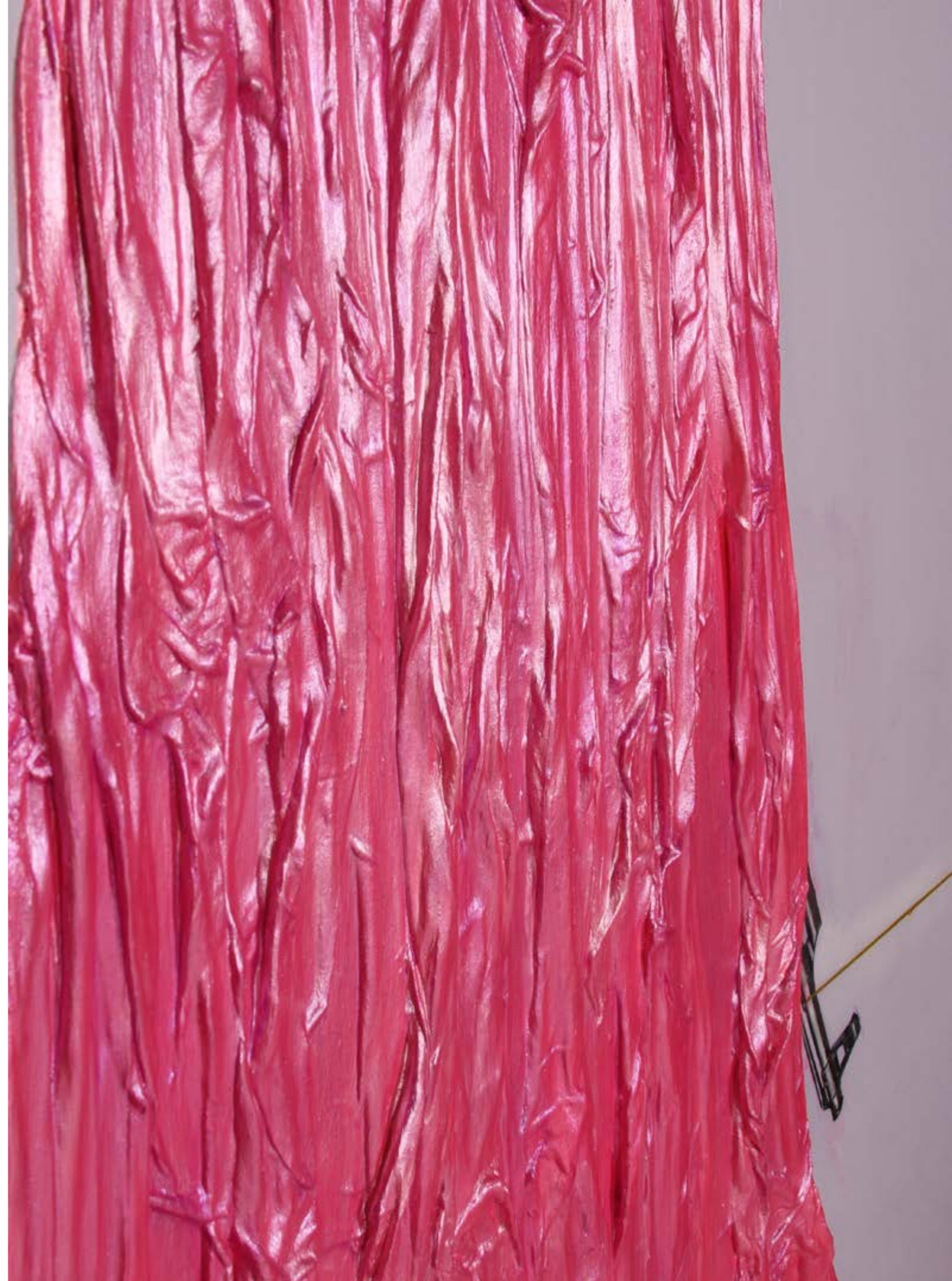
^ Gusmen H, Women and Gun , Cotton, acrylic on canvas, 220 x 200cm, 2017 > detail view