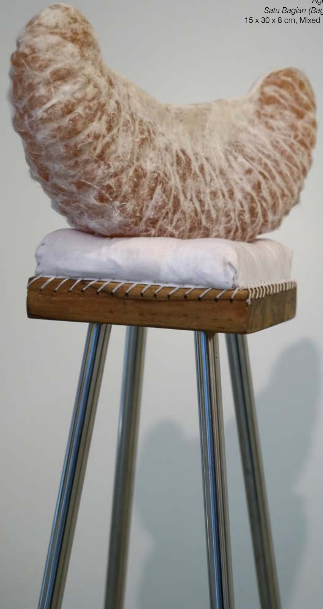
Agung Santosa Satu Bagian (Bagian Lainnya) 15 x 30 x 8 cm, Mixed media, 2017