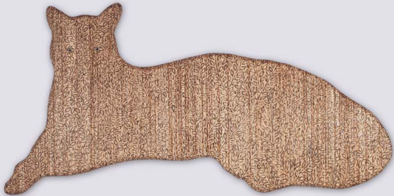
Alexis, Mengintai , Acrylic on multiplek, 245 x 128 cm x 15 mm, 2017