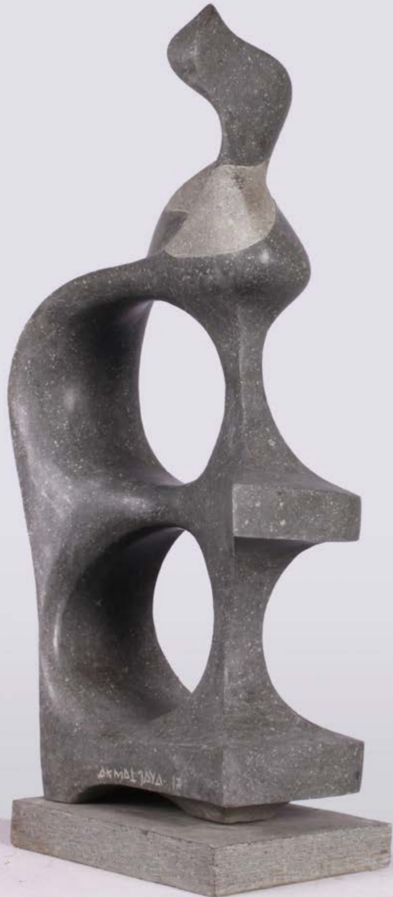
Akmal Jaya Tumbuh#4 113 x 70 x 25 cm Granite. 2017